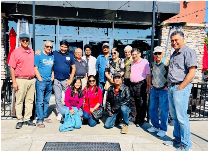
The spirit of unity and philanthropy continues to thrive among San Francisco Bay Area alumni, fostering connections across generations and strengthening our commitment to supporting our beloved Alma Mater.