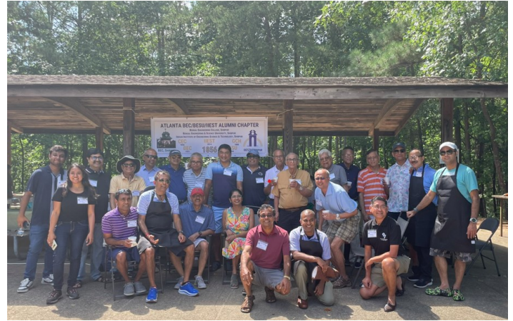
Picture 1: A snapshot of Atlanta Area Alumni present at the 2023 Picnic

GCH, BEC, BESU and IEST was another highlight of this year's picnic; see pictures below: